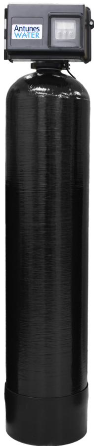
WFE Residential Iron Filter